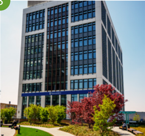
Office Building B / 10,781 m 2 / GF + 9 190 parking places / Available from H3 / 2019