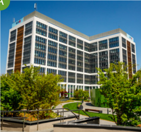
Office Building A / 21,933 m 2 / GF + 9 382 parking places / Available from H3 / 2019