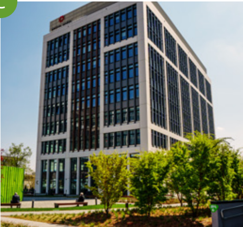
Office Building C / 10,443 m 2 / GF + 9 152 parking places / Available from H3 / 2019